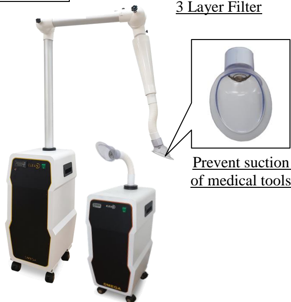
Prevent suction of medical tools